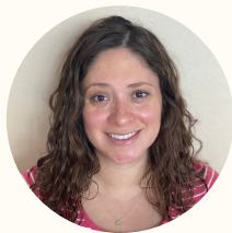
Mandis Broker SLP Austin, TX