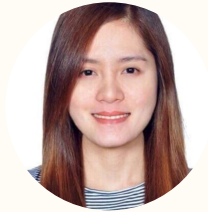
Princes Tipton RN Portland, OR