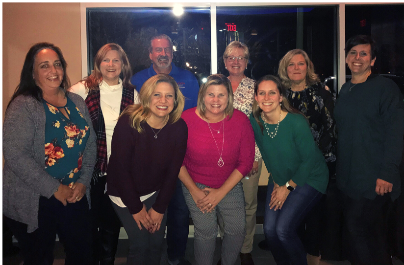
The Texas Clinical Managers gathered together!