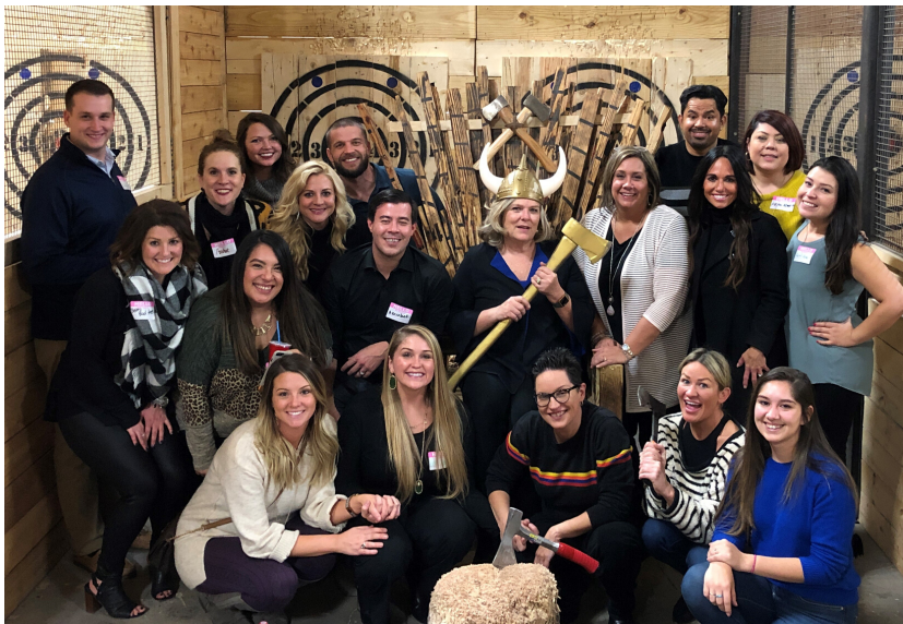
The Community Relations Team at their team building event