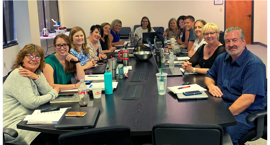
The Clinical Managers at the Addison Office for their Quarterly Meeting!

As of this year, we have 4 new Clinical Managers!