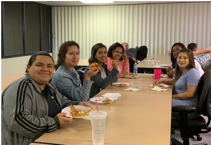
Celebrating our August Birthday's with a Pizza Party!