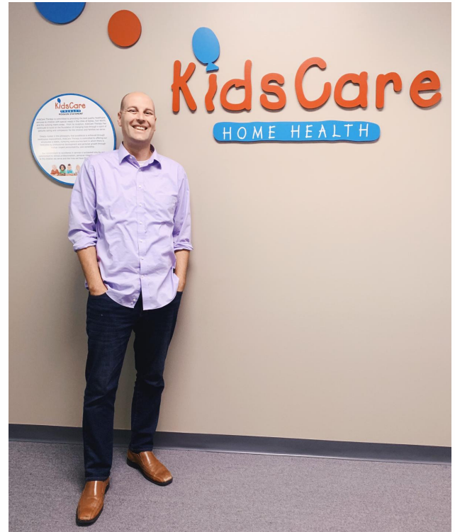
VICE PRESIDENT OF BUSINESS DEVELOPMENT AT KIDSCARE HOME HEALTH

☺☺ The biggest thing I have learned from working in the home health industry is that the only constant is change! This industry is ever evolving so you have to be ready to roll with the punches and keep up with all changes that come our way. ☺☺